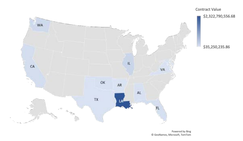
Figure 4. Military Contracts Performed in Louisiana by Contract Recipient State FY20

Louisiana is also a significant "place of performance" for defense work initially awarded in other states (Figure 4). Washington, California and Florida are the leading out-of-state sources for military contracts performed in Louisiana.