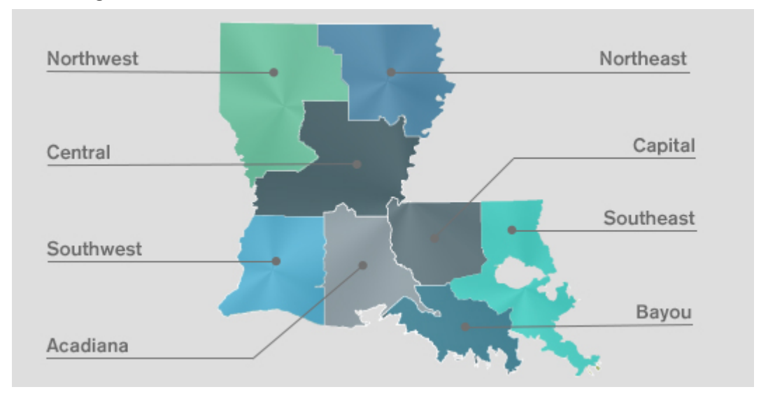
Figure 6. LED Regions