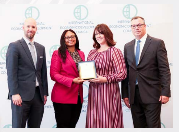
LED wins IEDC Gold Award for Entrepreneurship