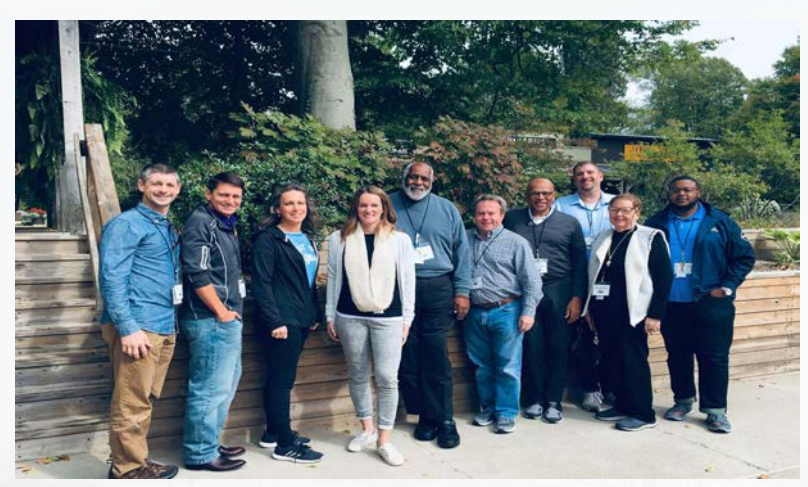
Leadership retreat at Edward Lowe Foundation (2019)

AMERICAN ACADEMY OF ENTREPRENEURS CEO ROUNDTABLES LEADERSHIP RETREATS LOUISIANA GROWTH LEADERS RURAL ENTREPRENEURSHIP INITIATIVE SPOTLIGHT LOUISIANA STRATEGIC RESEARCH 30/60/90 AFTERCARE