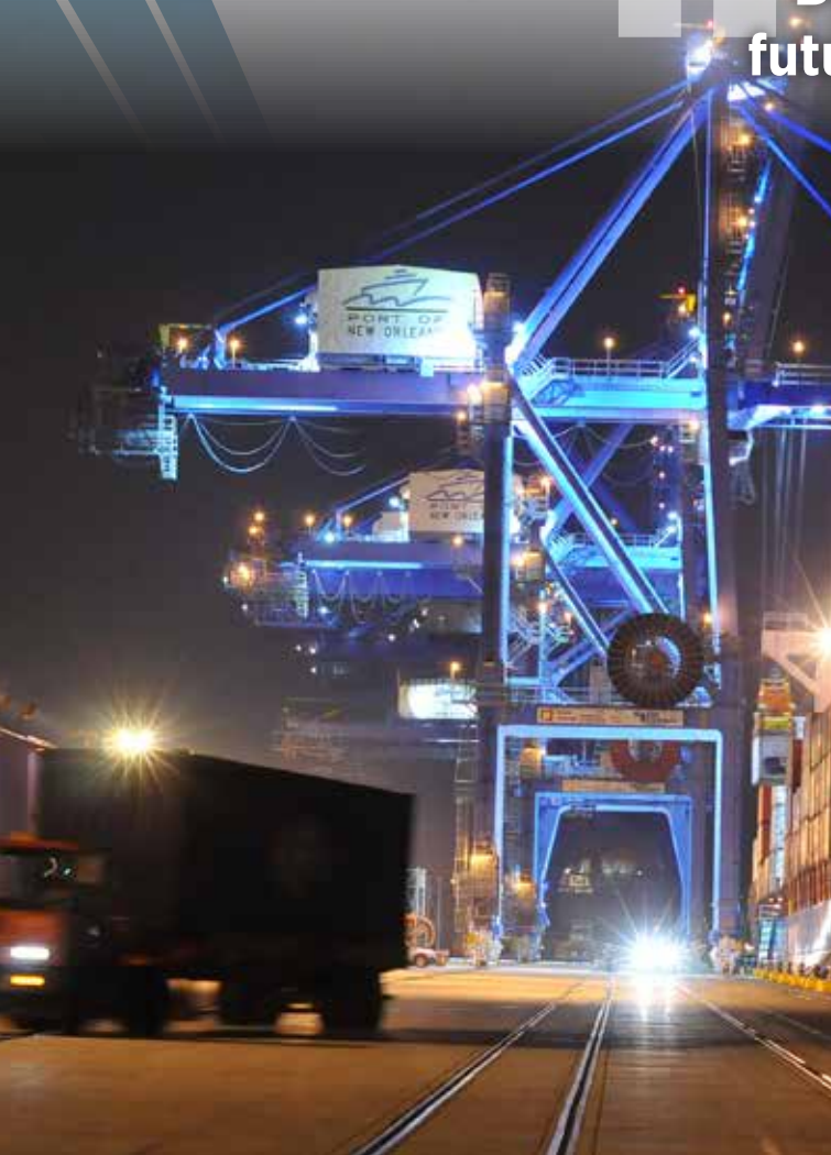
IMAGE LEFT: Fletcher Technical Community College, Schriever IMAGE BELOW: Port of New Orleans

plans to redevelop the New Orleans-area property as a global logistics hub heralding a 20-year target of over 5,600 jobs and $6 billion in additional payroll.